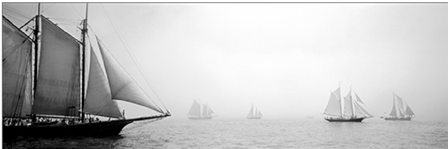
"Schooner Race, Gloucester" photograph, 40" x 13"

I've been a documentary photographer for nearly five decades. While I've made my living as a photojournalist working for magazines in the United States and Europe, at the heart of my work are my long-term personal projects. These are the subjects that have reached out and grabbed me and would not let go. I currently have six books in print from these projects and I'm working on number seven.