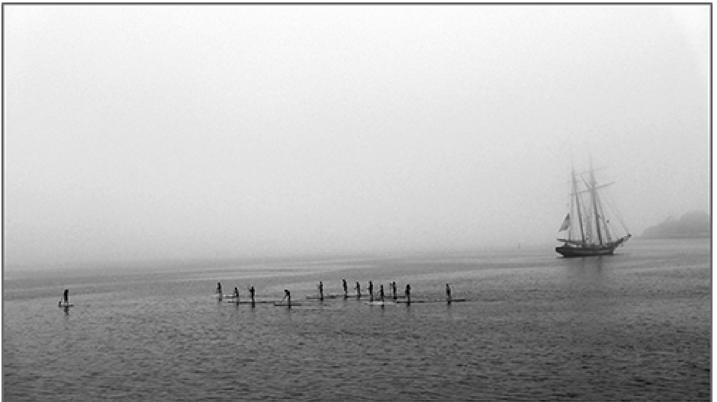
"Paddleboarders, Gloucester" photograph, 16" x 9"

What I've learned is that when you're passionate about a subject and willing to give it the time it requires, it will tell you its secrets including everything you need to know about how to photograph it, your choice of camera, lenses and even whether to shoot in black & white or color.