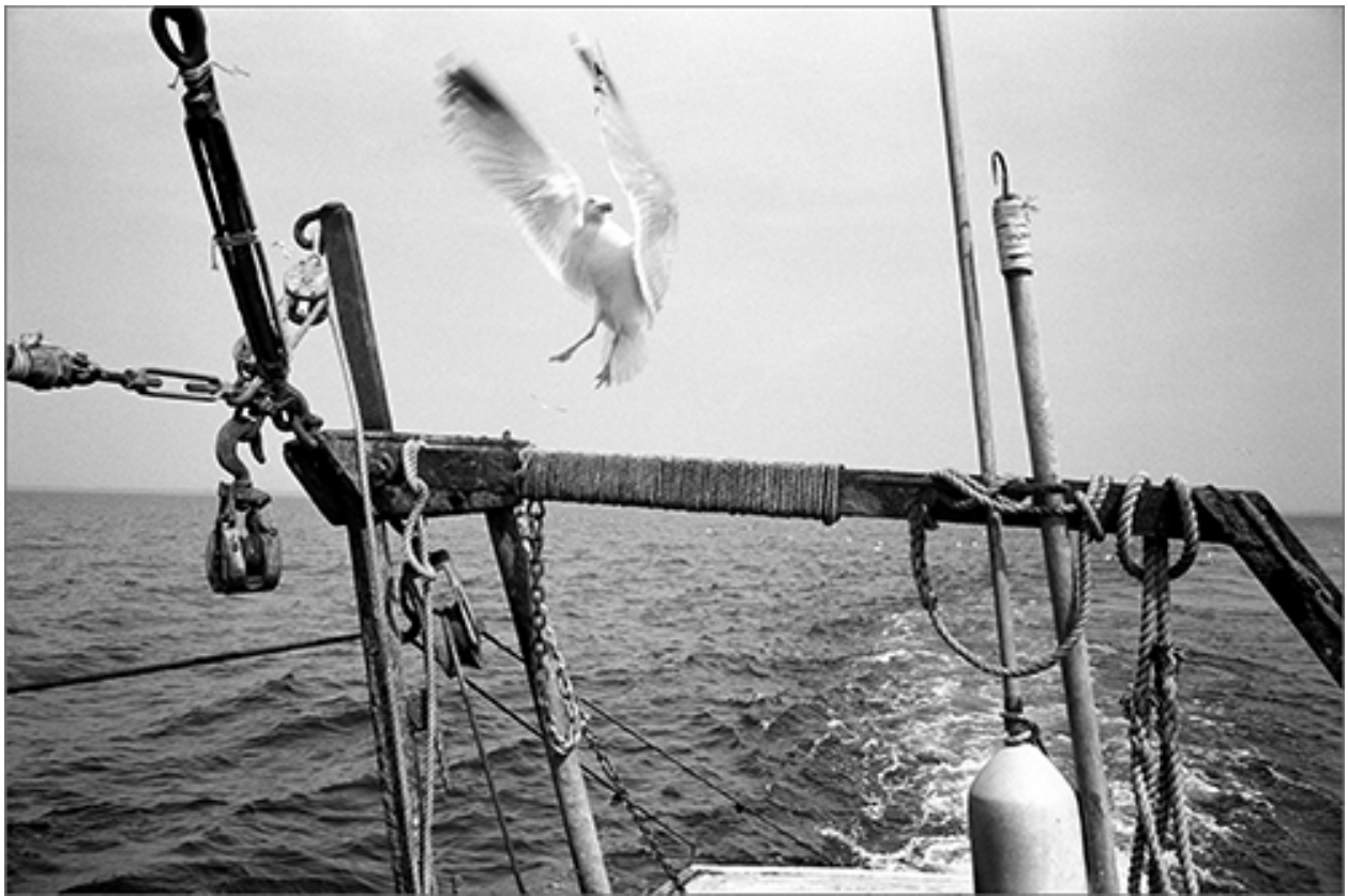
"Seagull, Cigar Joe II" photograph, 16" x 10.5"

This cultivates a way of seeing that captures the essence of the medium of photography, by putting a frame around something I'm seeing at just the right moment and then not manipulating it.