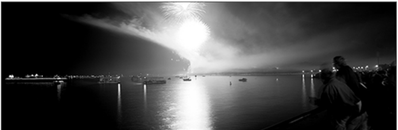
"Fireworks, Gloucester" photograph, 40" x 13"

I have lived and photographed in Gloucester, Massachusetts for my entire adult life. Most of the images included in this exhibition come from this body of work. Working where I live gives me the opportunity to return to the same places over and over again to capture the spirit and feeling of the place I love.