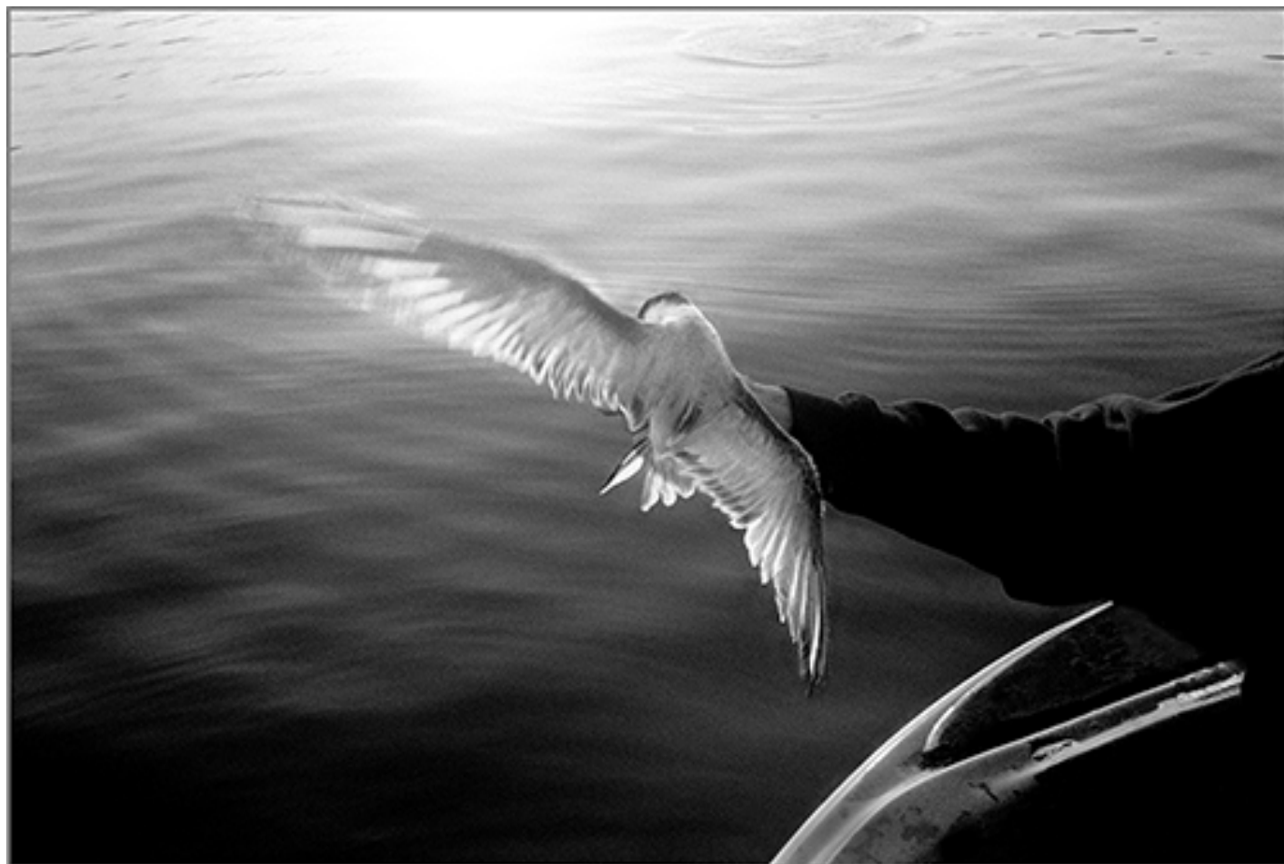
"Arctic Tern, Essex River" photograph, 20" x 13"

Artist Nubar Alexanian captures moments in time through stunning black & white photographs. Find more of his work by visiting his website .