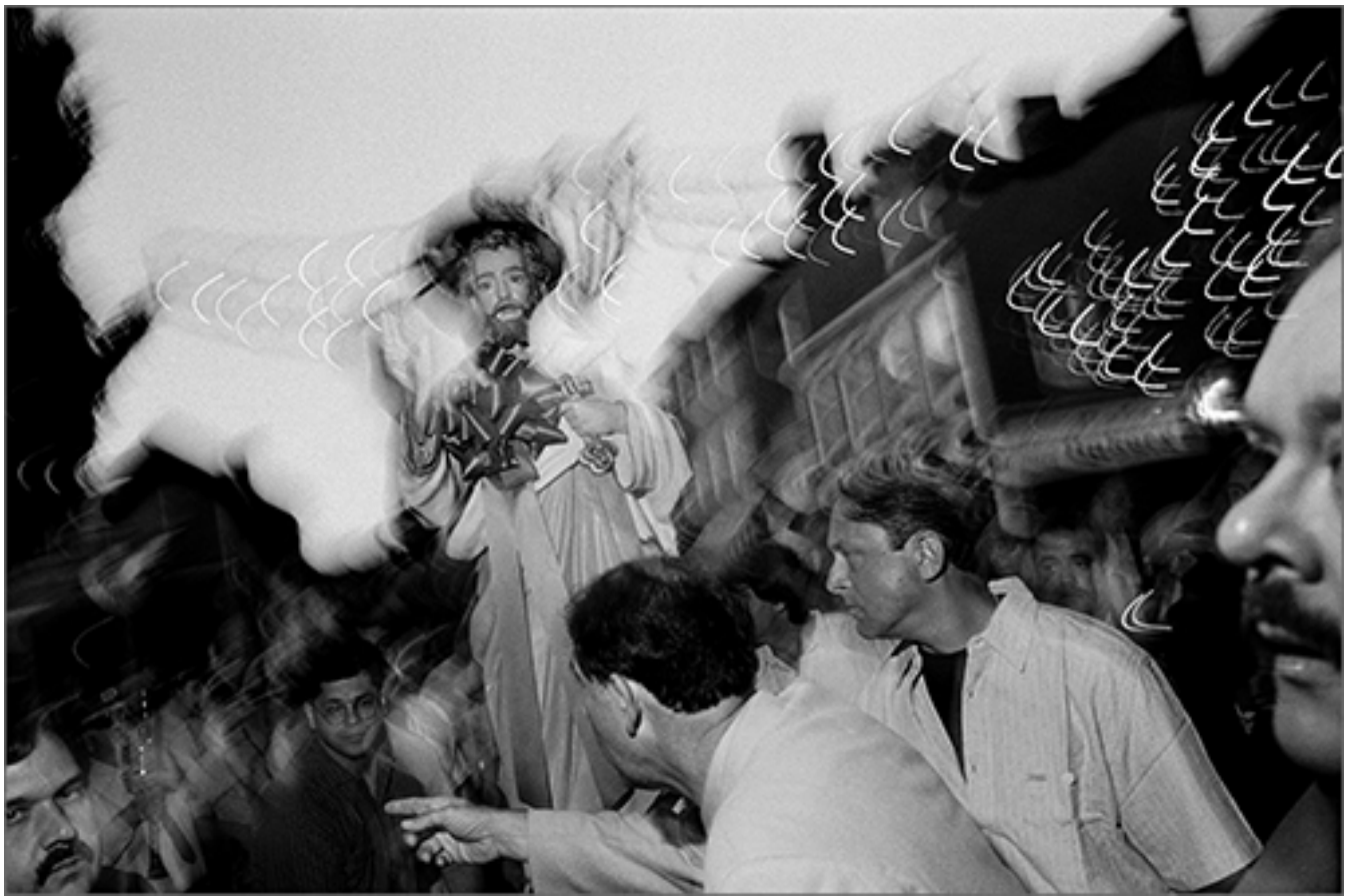
"St. Peters Fiesta, Gloucester" photograph, 20" x 13.5"

I love to make photographs that incorporate both what happens in front of the camera as well as what the image implies symbolically. It is this union the Boston Globe is referring to in a review that said "Alexanian's pictures are metaphors. Read them like poems."