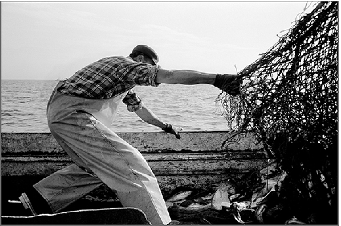
"Cigar Joe II Hauling Back" photograph, 20" x 13"

I love this process because it reveals the mystery and awe in all things large and small in our world. It has taught me how to develop my own visual vocabulary over time. It's like having my very own language in this remarkable medium.