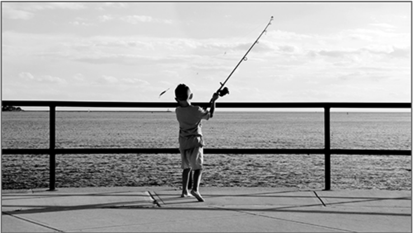
"Boy Fishing, Gloucester" photograph, 16" x 9"

What I've learned is that when you're passionate about a subject and willing to give it the time it requires, it will tell you its secrets including everything you need to know about how to photograph it, your choice of camera, lenses and even whether to shoot in black & white or color.