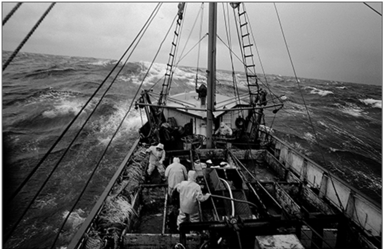
"Joseph Lucia II, Georges Bank" photograph, 20" x 13"

This cultivates a way of seeing that captures the essence of the medium of photography, by putting a frame around something I'm seeing at just the right moment and then not manipulating it.